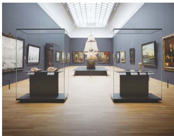
Top and right: The Rijksmuseum, Amsterdam, the Netherlands Left: Botanical Garden, Berlin, Germany