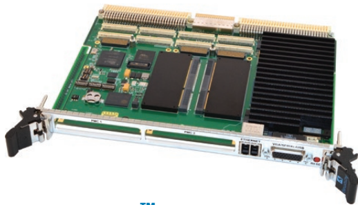
ARTIX™-7 FPGA-Based VMEbus Interface