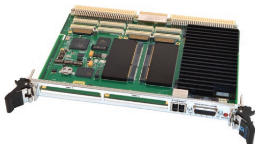
ARTIX™-7 FPGA-Based VMEbus Interface