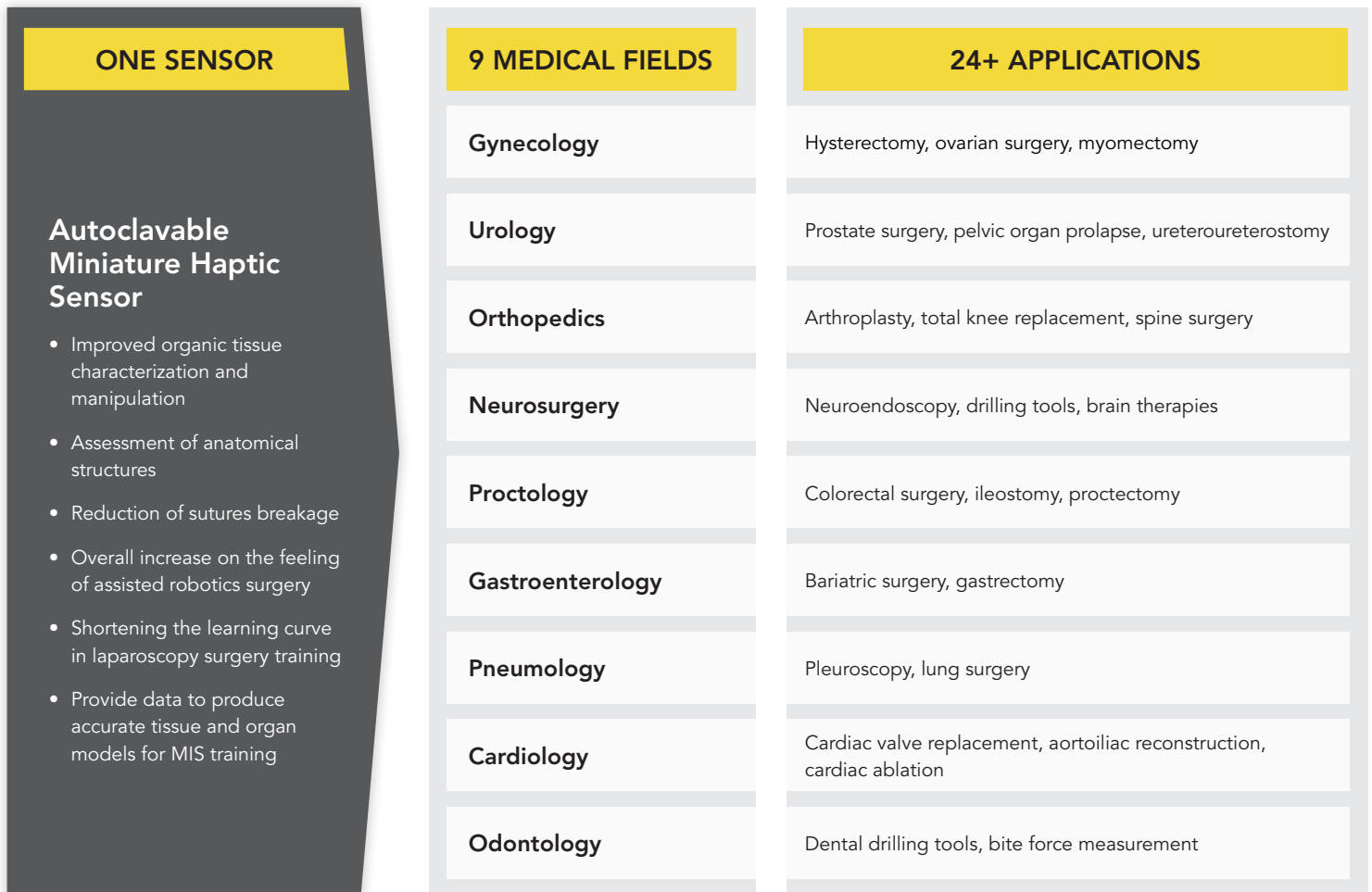
Figure 1. With a force, torque and pressure sensor enabling haptic feedback to the hands of the surgeon, robotics minimally invasive surgery can be performed with higher accuracy and dexterity while minimizing trauma to the patient.

The design and manufacture of a haptic feedback sensor for a robotic surgery platform entails two distinct but complementary aspects: overcoming technical obstacles of designing a sensor for intra- abdominal force measurement (miniaturization, biocompatibility, autoclavability and high reusability), while maintaining the minimally required specification of a high-grade force measurement solution (nonlinearity, hysteresis, repeatability, cross-talk, bandwidth and noise-free resolution). Furthermore, the sensor solution provider must have a talented and multidisciplinary engineering team, in-house manufacturing capabilities supported by fully developed quality processes and product/project management proficiency to handle the complex, resource-limited and multi-stakeholder new product development environment.