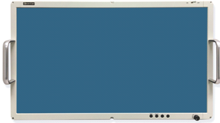
ARD27 Standard Unit

Argon offers a 27" QHD or 4K resolution rugged display that is designed for Command & Control applications where a large viewable surface area is needed. The ARD27's extremely small bezel size, flexible mounting configurations, configurable I/O, and universal AC/DC power supply make it a valuable solution for many mission critical applications.