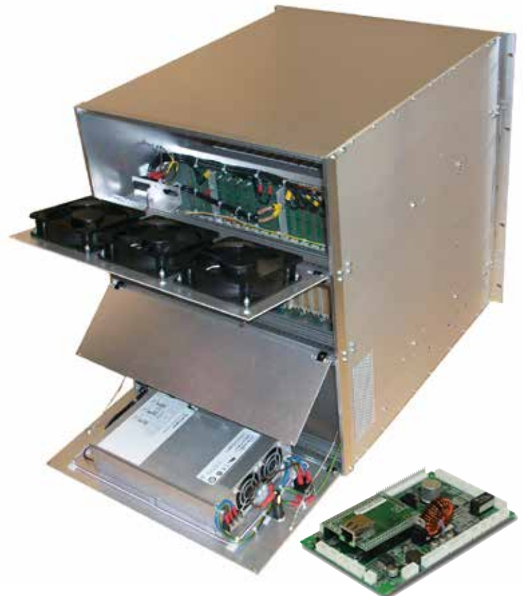
System Environmental Monitor

Additional Configurations Available Upon Request