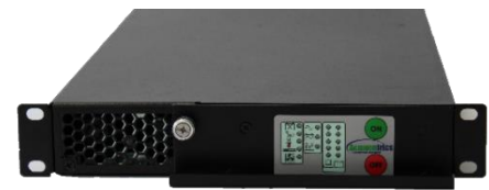
Front Panel control and indicator panel