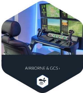
AIRBORNE & GCS