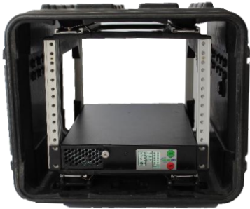
The Acumentrics 1/2 Rack UPS Shown in a 1/2 Rack Transit case