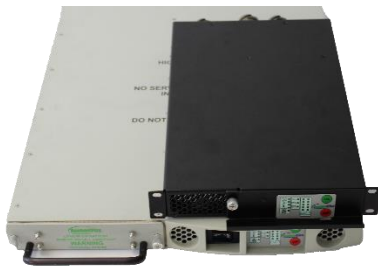
The Acumentrics 1/2 Rack UPS provides the same 1000W of power in less than have space of a full-size UPS.

AC in, DC Out 20-29VDC, 1000W, LFP Battery, XR Battery connection, SNMP