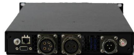
Rear Panel with AC IN, DC OUT, Extended Run Battery, Communications, and optional SNMP Interfaces