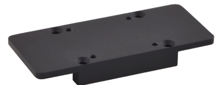
AP-CC-01 Conduction-Cool Kit

Linux ® support (website download only).