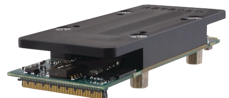
APZU-30x with included heat spreader attached

Linux ® support (website download only).