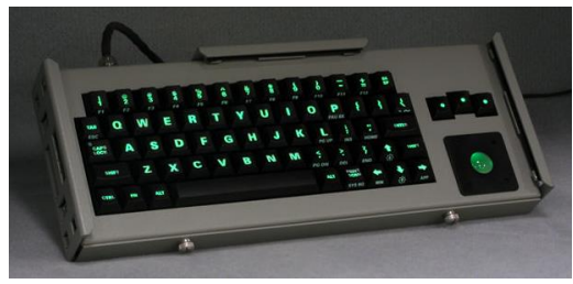
Rack Mount Model 62 with green backlighting

Optional Extreme High Shock Protection (+100gs): Includes shock sensing (Stop Codes) and keycap clips as well as other options