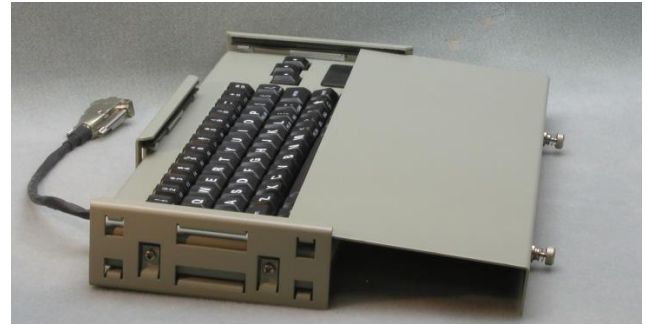
Model 62 with integral, removable cover and 1" trackball

Many options and configurations are available – mounting options include table top (with or without feet for bolt down applications) or mounting in keyboard trays with integral / removable covers. The Model 62 can be ordered with or without an integral pointing device for a complete, compact data entry solution.