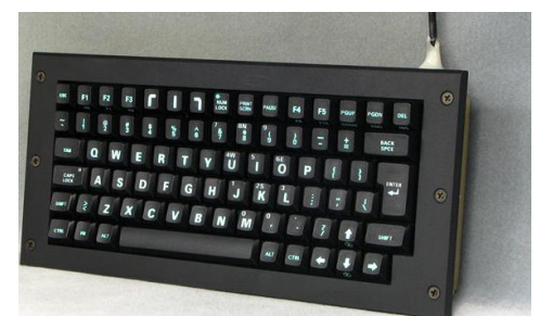
Model 79 with integral, removable cover and 1" trackball

Many options and configurations are available – mounting options include table top (with or without feet for bolt down applications) or top mount flange designs. The Model 62 can be ordered with or without an integral pointing device for a complete, compact data entry solution.