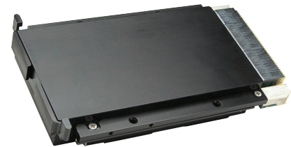
VPX REDI VITA 48 version