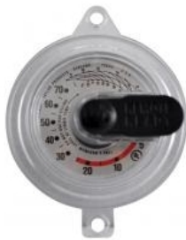
R3D LP Dial Sr. Tab

The ALTA Propane Level Monitor supports both Jr. and Sr. R3D Gauges. Monnit's level monitor does not support anything outside of this specification.