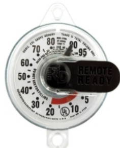
R3D LP Dial Jr. Tab