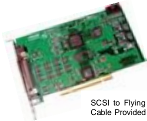
SCSI to Flying Lead Cable Provided