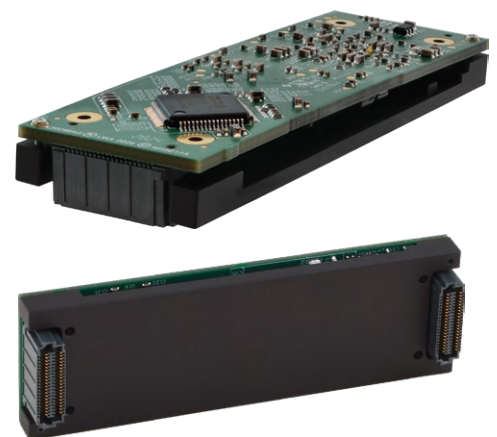
Example QMC Module shown with attached heatsink included with conduction-cooled QMC Modules.

Universal Embedded Design Suite with software support for VxWorks®, Windows®, and Linux®